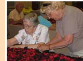
AUGUST ~ Vacation Bible School FOR the Senior Adults

Stay tuned for a listing of our fall activities!