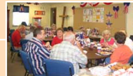
JULY ~ 4th of July Party