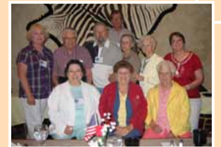
JUNE ~ Senior Adult Christian Conference in Branson

Stay tuned for a listing of our fall activities!