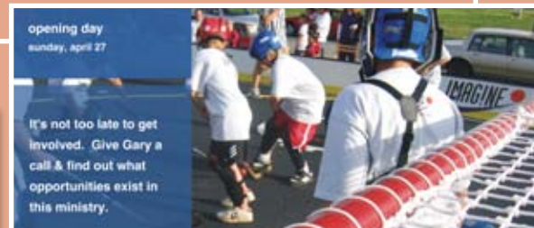
opening day sunday, april 27

We will be honoring our high school graduates at our 9.30 a.m. service on Sunday, May 18. If you have a grad that would like to participate, contact the church office by Wednesday, May 14.