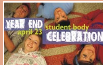
YEAR END student body april 23 CELEBRATION

SPECIAL EDITION of Student Body this week. Middle School and High School combined at 7:30 p.m. in the Student Center. This is our last SB of the '07-'08 school year.